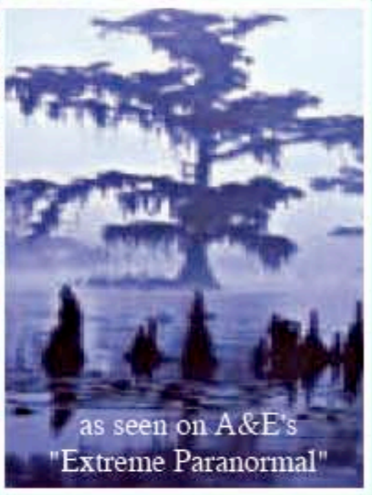
as seen on A&E's "Extreme Paranormal"

Swamp Tours Also Available Call 1-866-671-8687 Toll Free