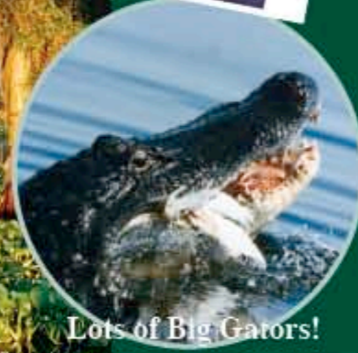
Lots of Big Gators!

As seen on CNN, The Travel Channel and in National Geographic!!